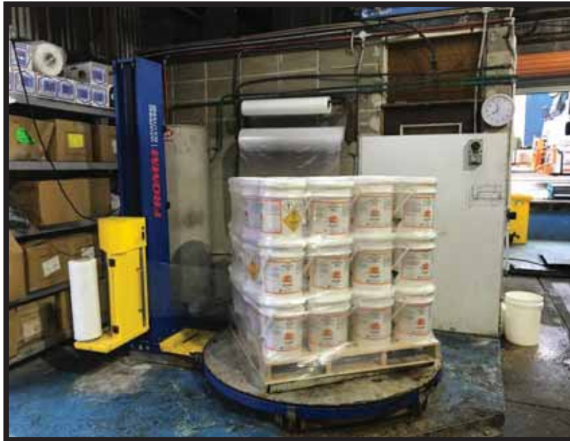
BLENDING PLANT AUTOMATIC STRETCH WRAPPING MACHINE