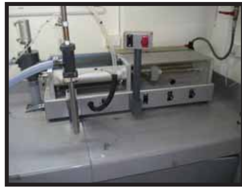
SINGLE HEAD FILLERS