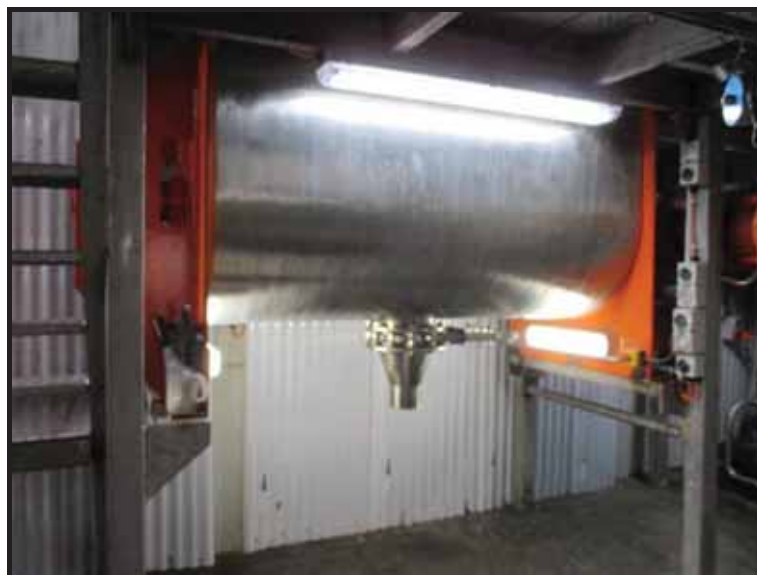
2,000kg RIBBON S.S. POWDER BLENDER