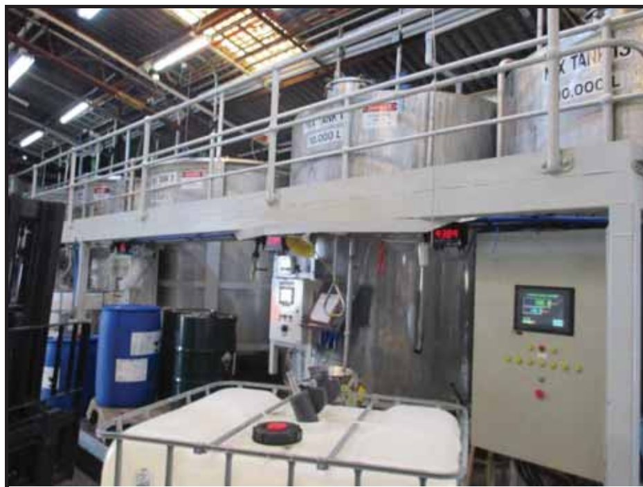
5 X 10,000L MIX TANKS WITH AUTO/BOOM SMART FILLERS