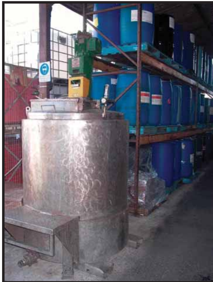
1200L FLAMMABLE HEATED MIXING TANK

Formula owns seven Clark S Series 2.5 Tonne Forklifts. All these units were purchased brand new in 2024 and are regularly maintained under an agreement through Clark Fork Lifts Australia.