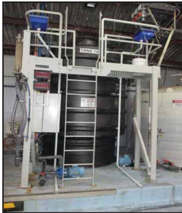
10,000L FIBREGLASS MIX TANKS SUITABLE FOR ACIDS/CHLORINE BASED SPECIALITY CHEMICALS WITH AUTO SMART FILLER