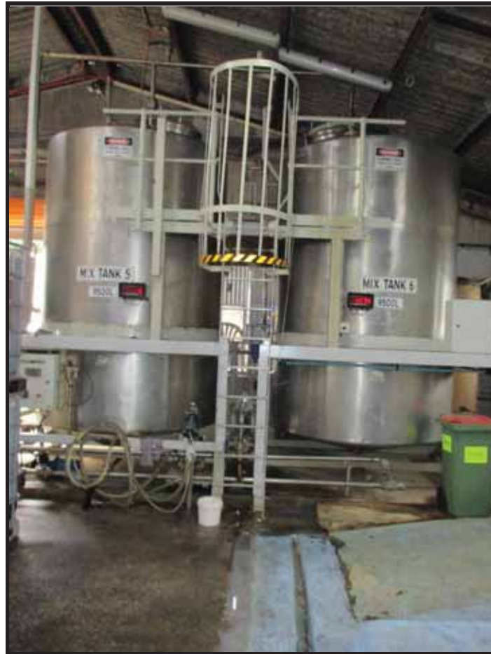
2 X 10,000L DEDICATED SOLVENT MIXING TANKS WITH AUTO SMART FILLER