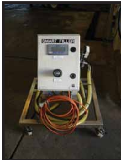
PROGRAMMABLE SMART AUTO FILLER FOR QUANTITIES UP TO 1500L IBC'S