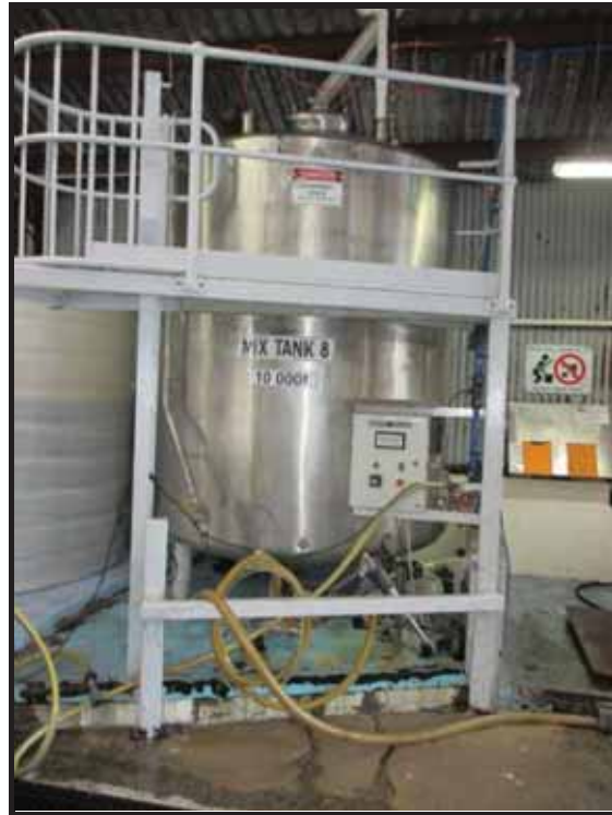
10,000L DEDICATED GLASS & CHROME CLEANER MIX TANK WITH SMART FILLER