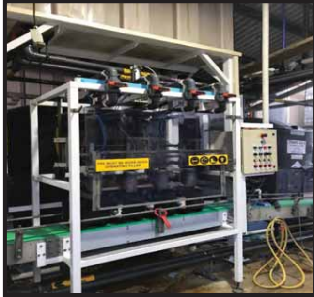
HYDROCHLORIC ACID FILLING PLANT (40,000L STORAGE CAPACITY)