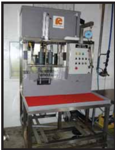
TWIN HEAD 5L SMART FILLER