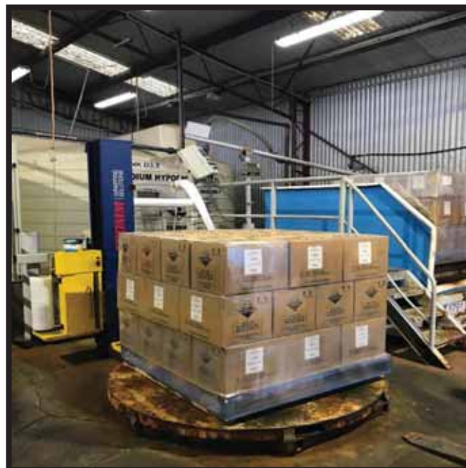
SODIUM HYPOCHLORITE PLANT AUTOMATIC STRETCH WRAPPING MACHINE