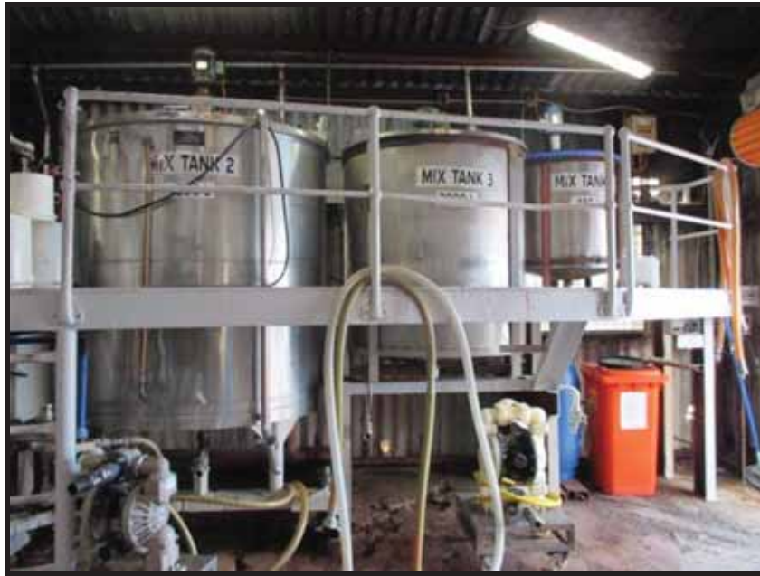
VARIOUS MIX TANKS FROM 450L TO 4,500L WITH AUTO SMART FILLER