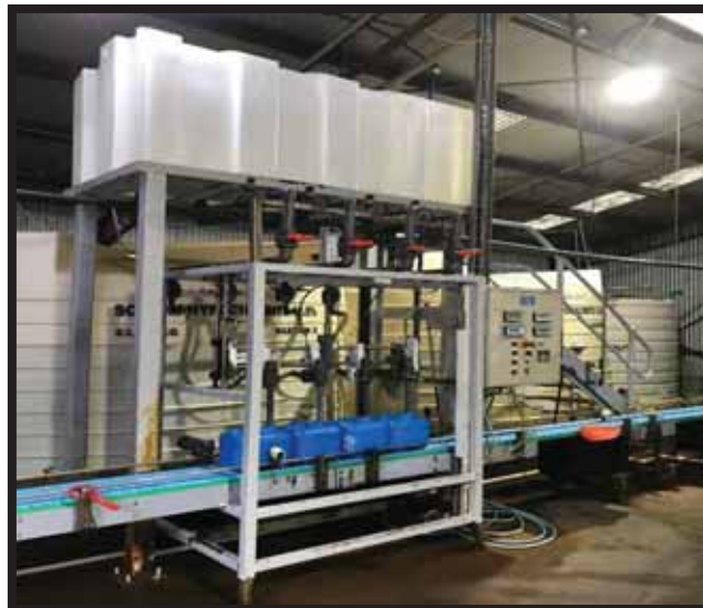
SODIUM HYPOCHLORITE FILLING PLANT FORMULA'S MODERN CHLOR/ALKALI STORAGE AND FILLING EQUIPMENT (110,000L STORAGE CAPACITY)