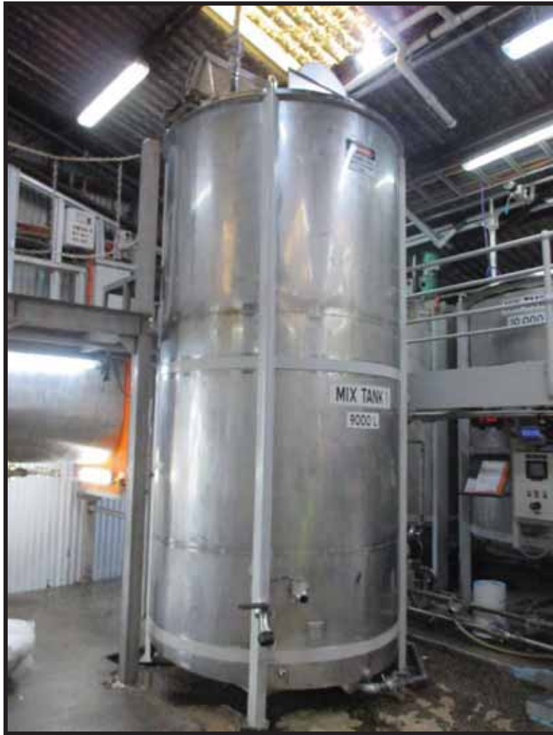
9,000L S.S. SLURRY MIX TANK